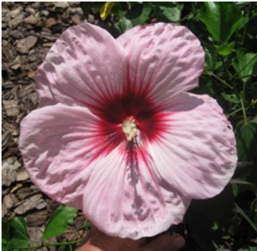
Illustration 3: Kopper King

Our native Hibiscus moscheutos , statuesque at heights of six feet or more in the wild, bears large, broad-petaled rosy to white bowl-shaped blossoms for weeks in wilting heat. Added to its tropical good looks is a hardiness range extending from our coastal plain to northern states from Massachusetts to Michigan. Plant breeders have been paying attention, and twenty or so years ago the Disco Belle series of seed-produced hybrids was launched; the first to grab American gardeners attention in a big way. Twelve-inch blooms on compact plants, flashy colors, and success for minimal effort, ensured their popularity then and today. Seed strains