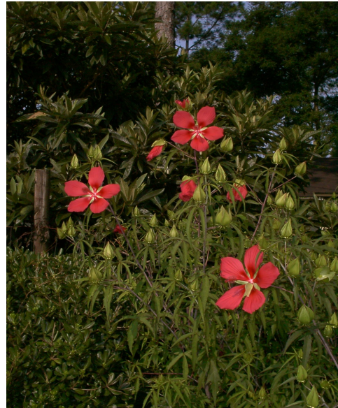
Illustration 1: Swamp Mallow

Every gardener knows that summer in Florida is tough. Even some of our most reliable color plants get lazy during July and August, and just quit blooming. But there is a cure for the summertime garden blahs, when floral effects wilt and pale under seasonal heat. The search for solutions can begin in our regional marshlands and ditches. Here native swamp mallows can be seen blooming merrily through the summer months. Their distinctive funnel-shaped blossoms appear in vivid shades of red or white, often with a darker contrasting eye. It's delightful enough to see these six-inch flowers at fifty-five miles per hour; imagine the eye-popping possibilities of modern hybrids with saucer-like flowers up to one foot across!